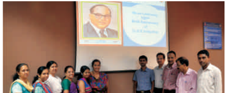
14/04/2016 : Dr. B. R. Ambedkar Jayanti