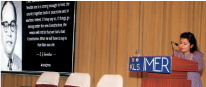
26/11/2015 : Constitution Day