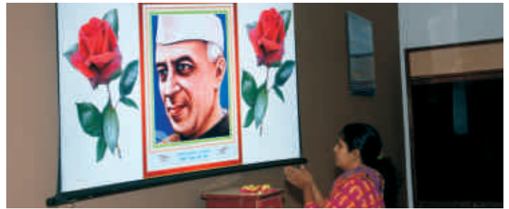
14/11/2015 : Children's Day