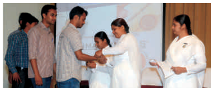
31/08/2015 : Raksha Bandhan