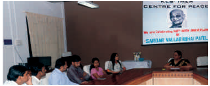
31/10/2015 : Sardar Vallabhghai Patel Jayanti