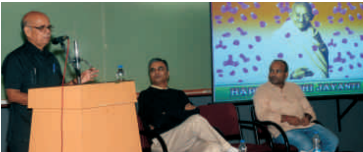
02/10/2015 : Gandhi Jayanti