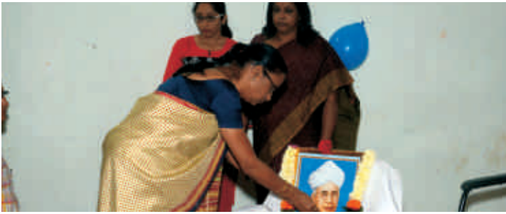
05/09/2015 : Teacher's Day